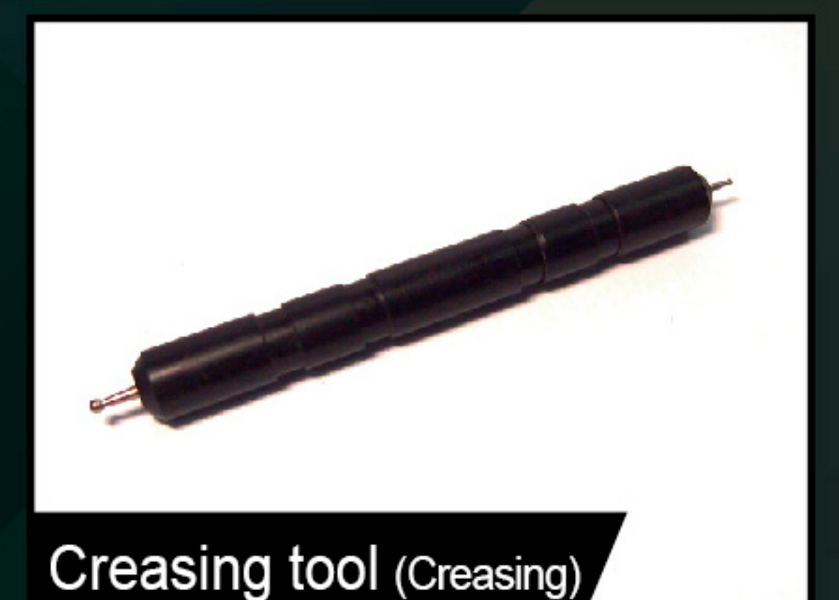
Creasing tool (Creasing)