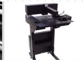
Auto Sheet Feeder(Optional)