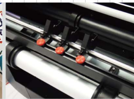
Slitting Module (Optional)